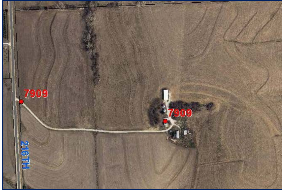
Figure 2. Placement of address point on primary entrance path within a parcel boundary as shown on the left address point for 7909. The illustration also shows the placement of the address point on the primary structure footprint. This is helpful in cases where the primary building is difficult to see from the primary entrance path off an addressed road.

property. Address points should be located at the primary driveway entrance within a parcel boundary. This point is placed only after the primary structure address point has been identified and placed or if there is no primary addressable structure on the property parcel. If parcel data exists to the property, then the point should fall within the parcel boundary in the middle of the driveway or other access area.