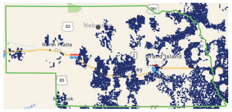
Initial RDOF eligible locations in Nebraska

"The carrier instead of going into RDOF by themselves making a reverse auction pitch of say $100 a home to provide fiber—if they have the city's partnership commitment to serve as an anchor tenancy—then they can